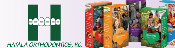
Thank you Dr. Hatala's Orthodontics for donating Girl Scout cookies to the Daniells House.