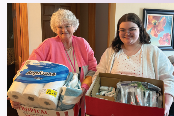
Binghamton Housing Authority dropped by with donations for us.