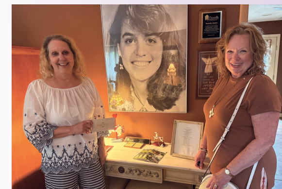
Gift from Our Lady of Sorrows Knights of Columbus Women's Auxiliary