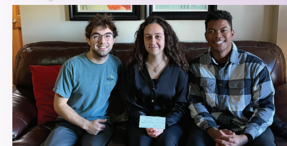
Binghamton University Pharmacy School ALPHA-ASP