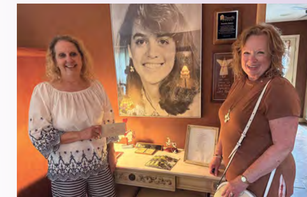
Gift from Our Lady of Sorrows Knights of Columbus Women's Auxiliary