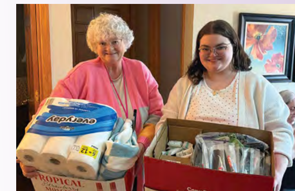
Binghamton Housing Authority dropped by with donations for us.