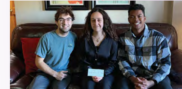
Binghamton University Pharmacy School ALPHA-ASP